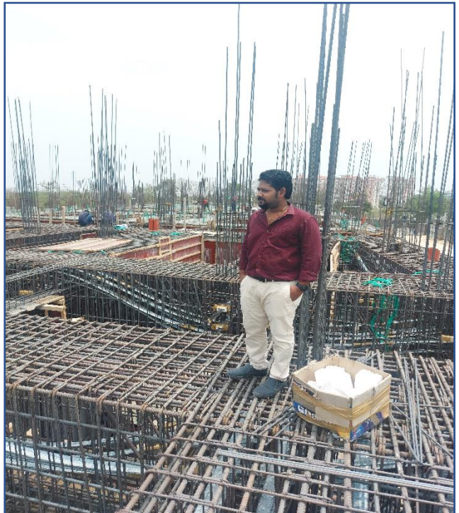
Oxygen Home Hyderabad site execution.