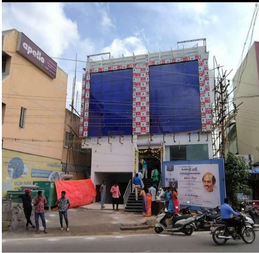
SWATHI HOSPITAL AT THIRUVANNAMALAI.