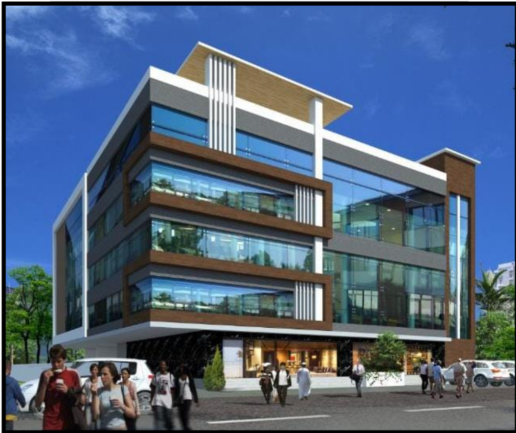
COMMERCIAL BUILDING AT KOKAPET HYDERABAD.