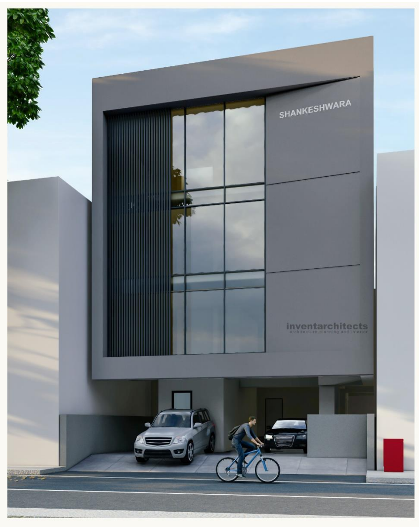
COMMERCIAL BUILDING FOR INVENT ARCHITECT AT CHINDADRI PET CHENNAI.