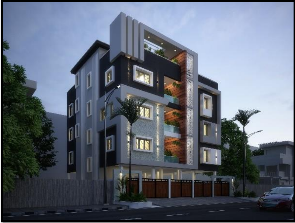
APARTMENT BUILDING AT CHENNAI