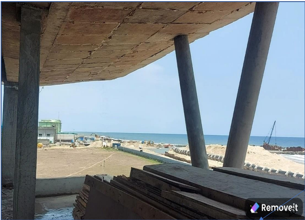
Farm House at ECR Chennai.

FREE STANDING CANTILEVER WITH FINITE ELEMENT MODEL