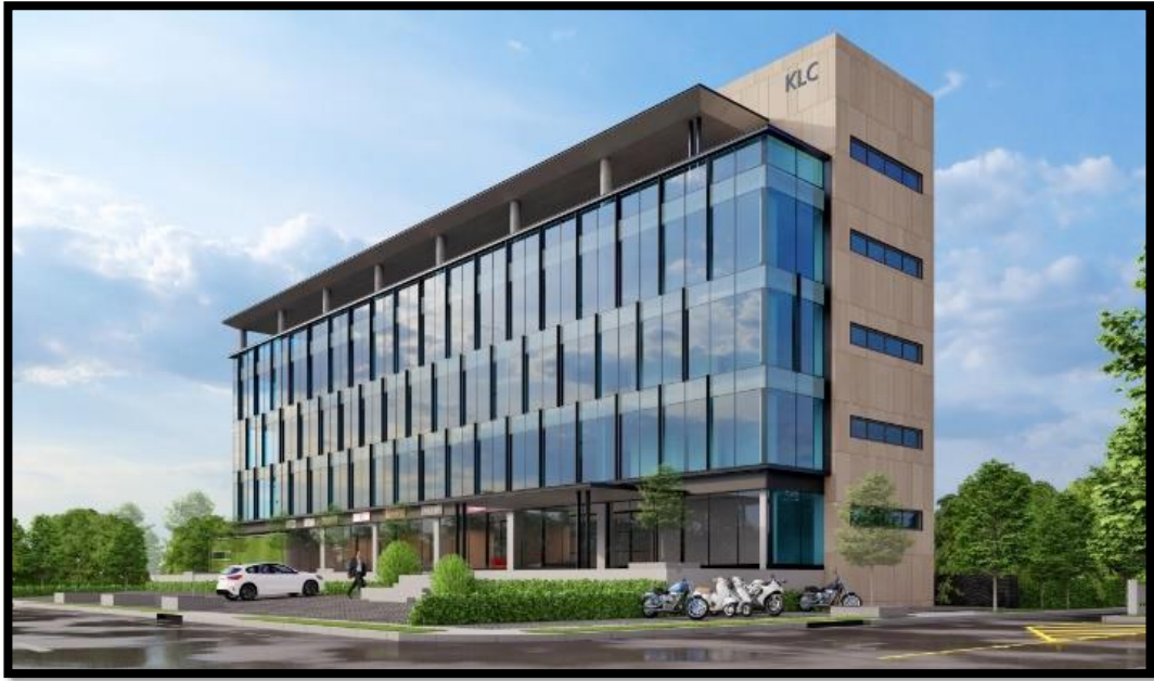
POST TENSIONING SLABS FOR HOSPITAL BUILDING AT AMEERPET HYDERABAD.