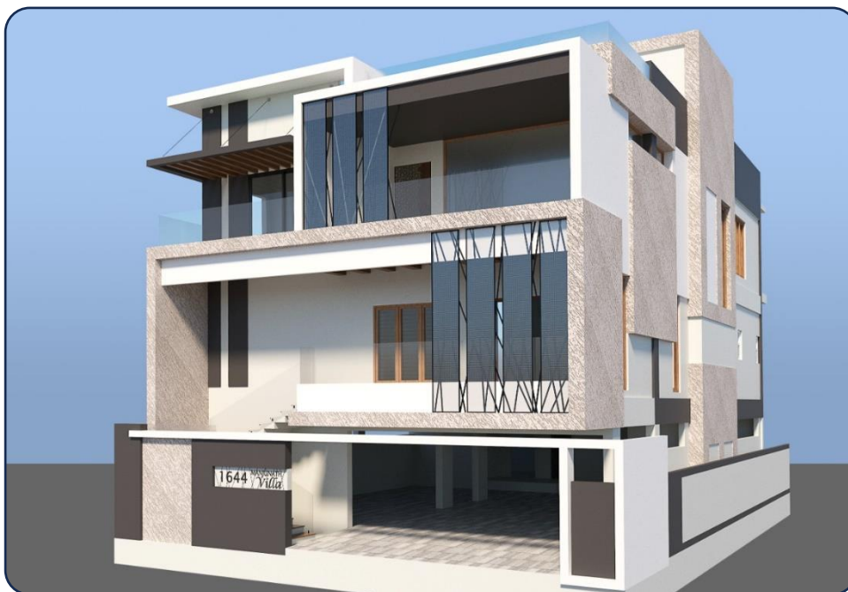
Residential Building at Bangalore