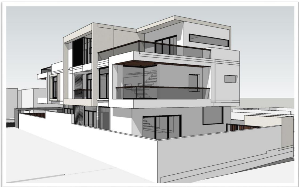
RESIDENTIAL BUILDING FOR Mr.VINAY AT ECR CHENNAI.