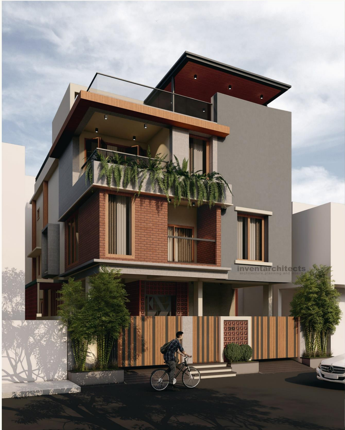
RESIDENTIAL BUILDING FOR Mr.KANDHASAMI CHENNAI.