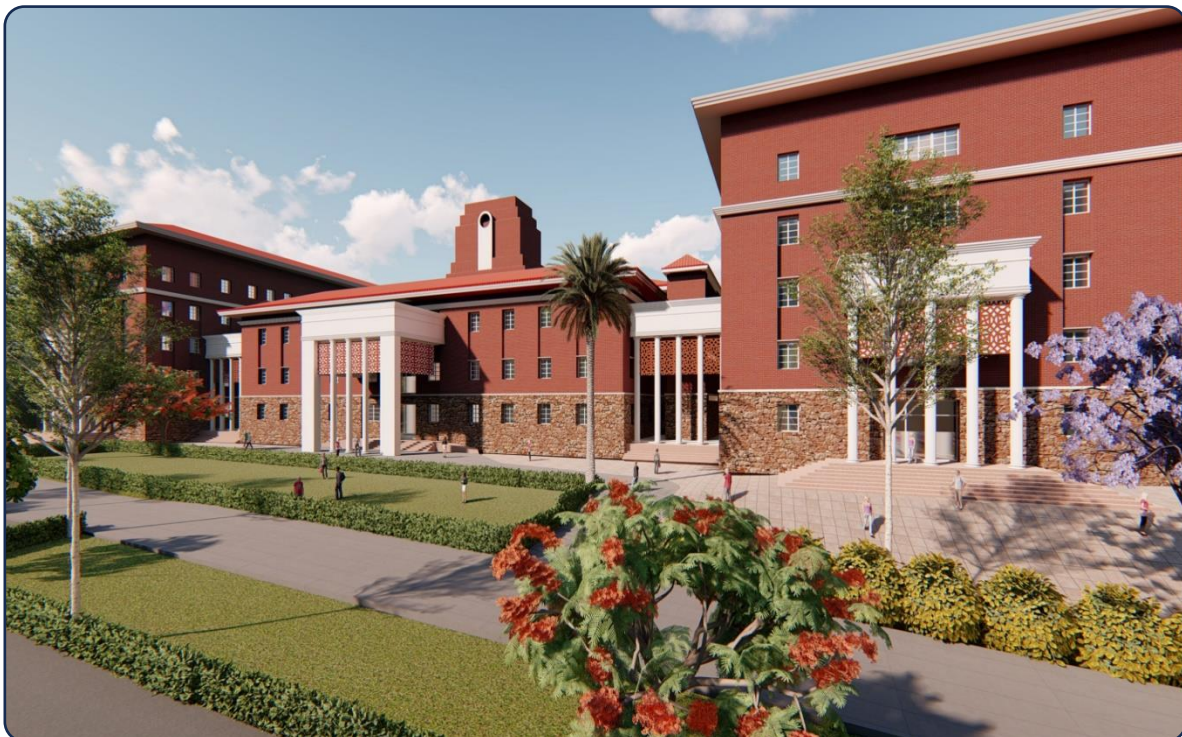
MEDICAL COLLEGE AT BAPATLA, ANDRAPRADESH.