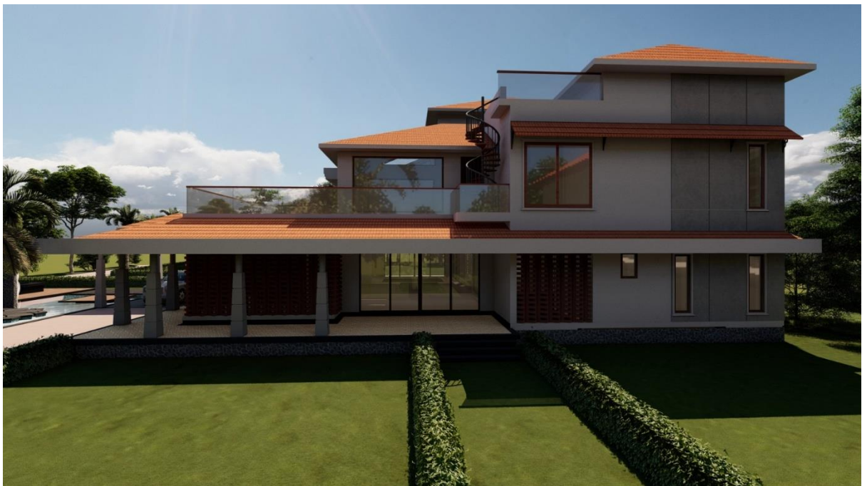
LEVISTA COFFEE MD's RESIDENCE AT BANGALORE.