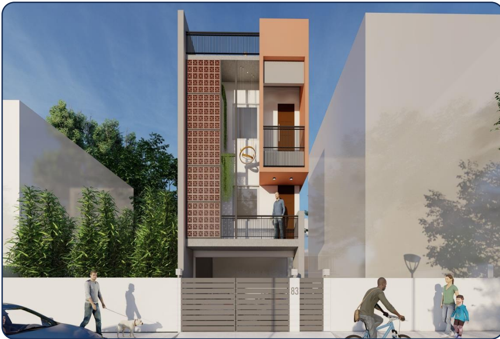
Residential Building for Invent architects