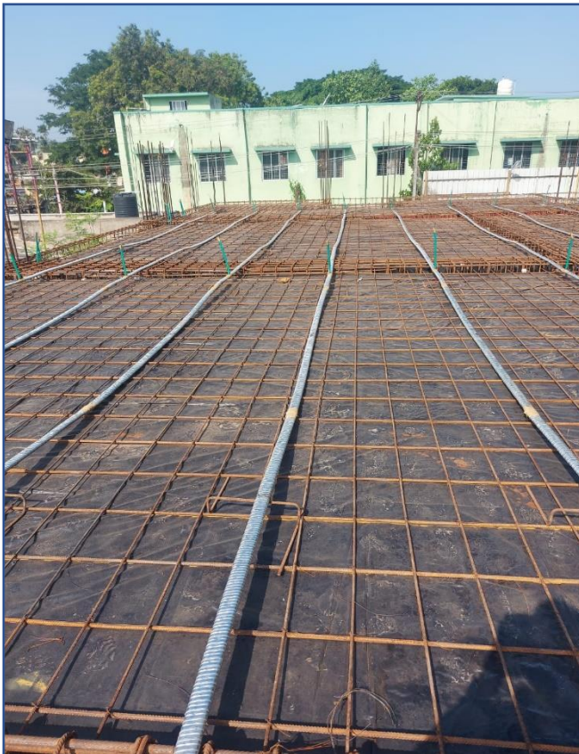
Commercial Building at Maiyladuthurai