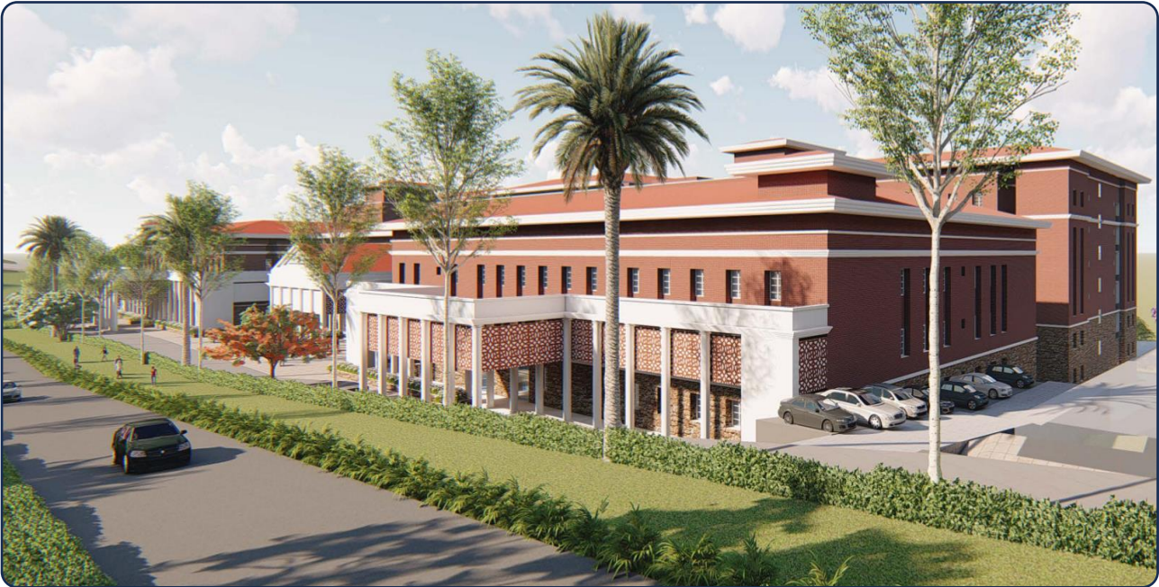
MOMENT VERIFICATION WITH FEM MODEL