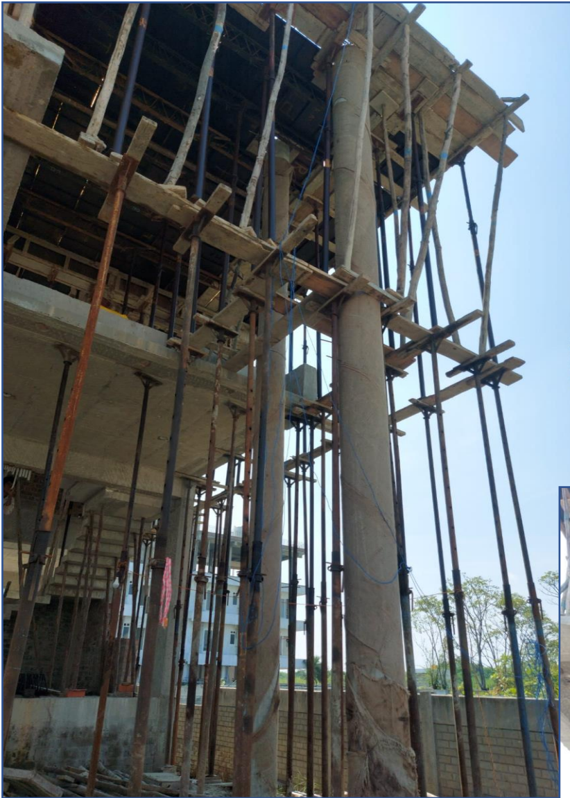
Residential Building at Pannaiyur Chennai.