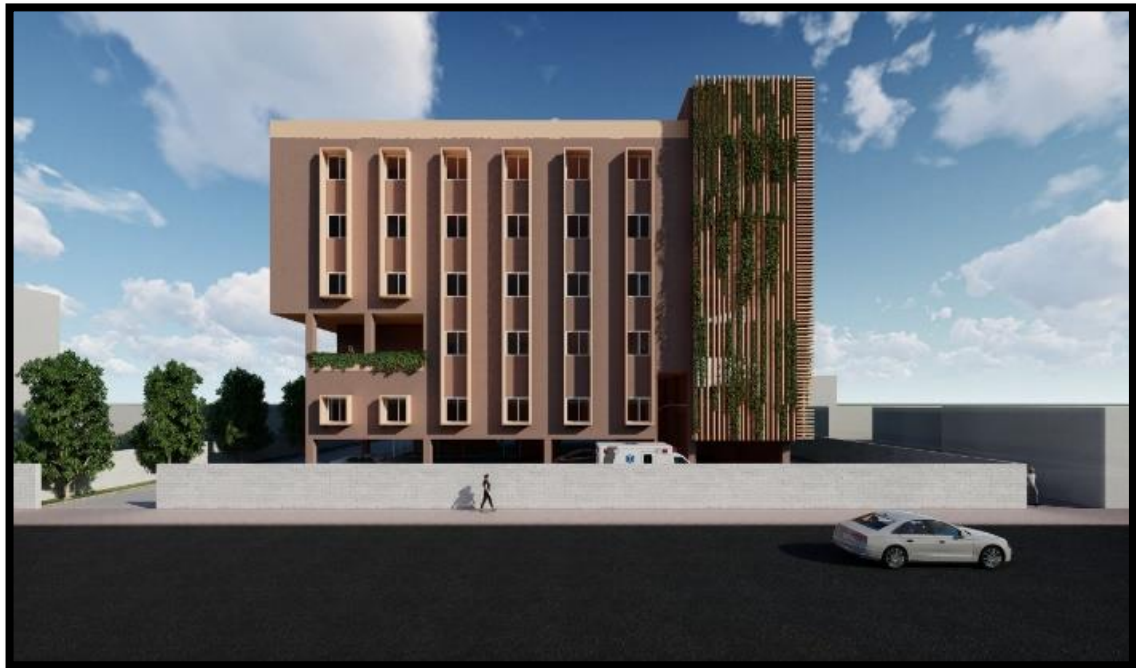
KLC HOUSE AT HYDERABAD