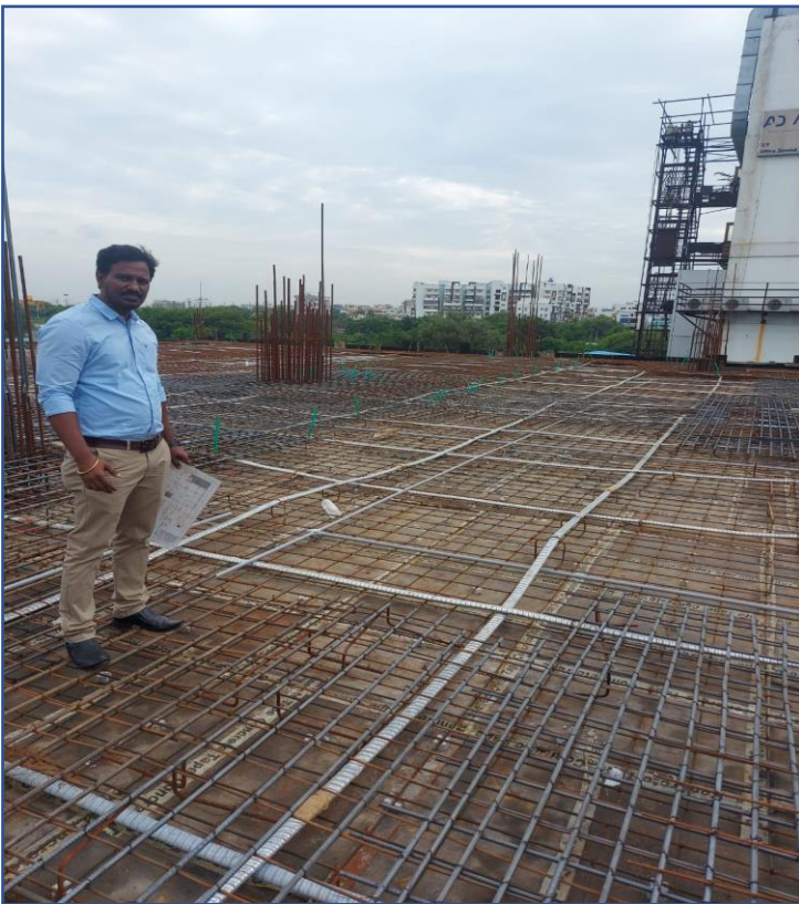
COMMERCIAL BUILDING AT UPPAL HYDERABAD.