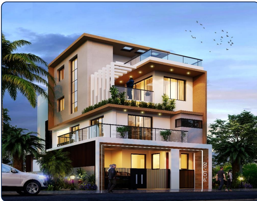
Residential Building for Brindavan Promotors